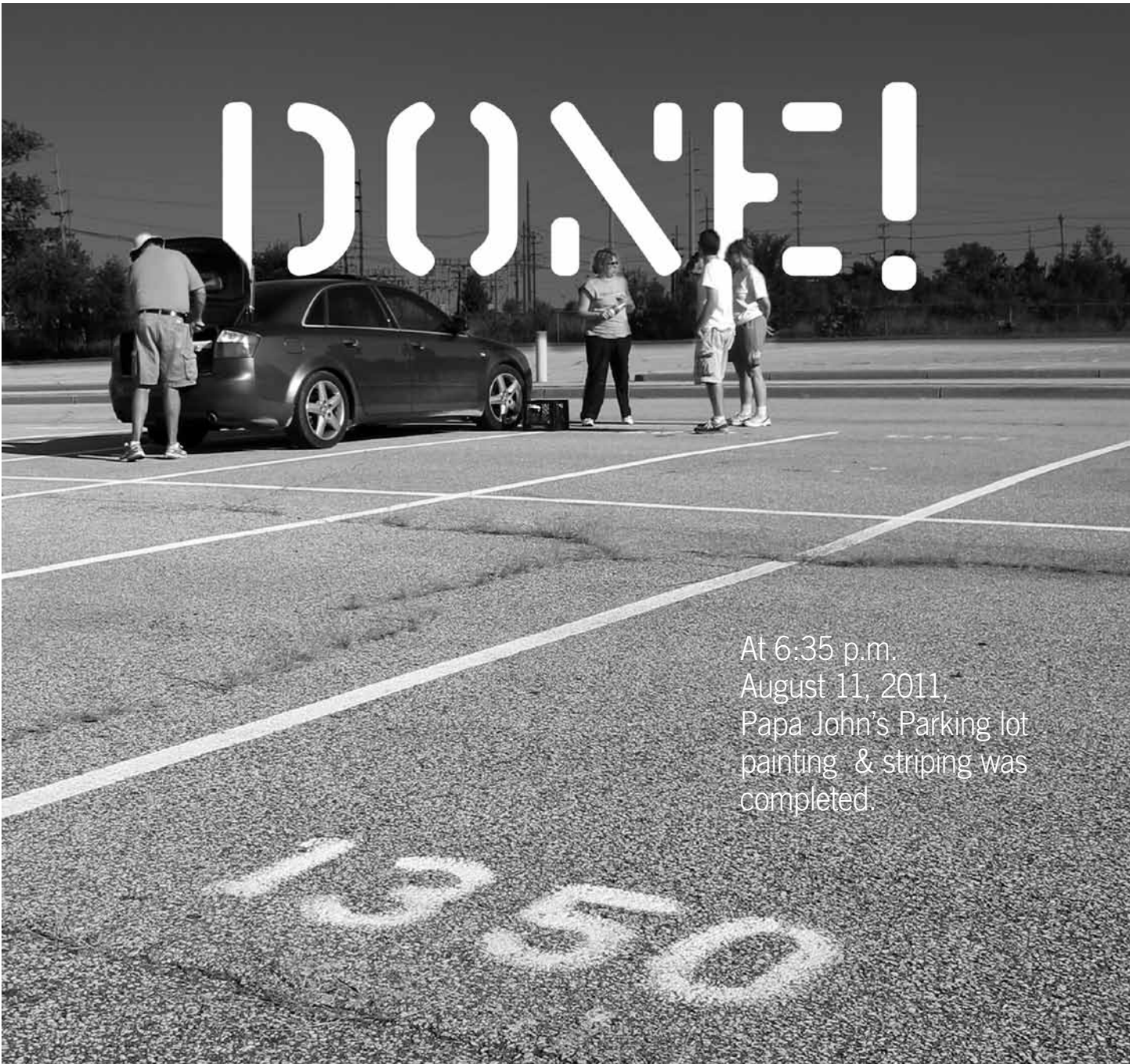
At 6:35 p.m. August 11, 2011, Papa John's Parking lot painting & striping was completed.