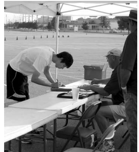
Above: An eager student signs in for a summer school he won't forget