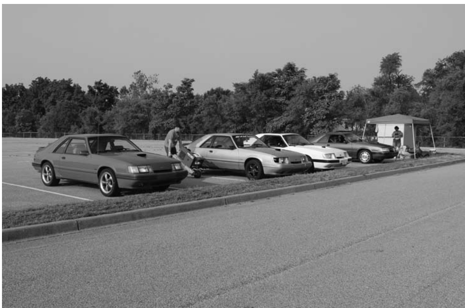
Group SVO prepares for school. On this hot day, hydration and sun screen was a must.