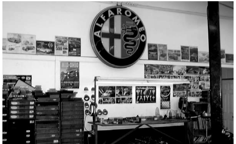
Bruce's collection of memorabilia is worth the price of admission, or at least a beverage.