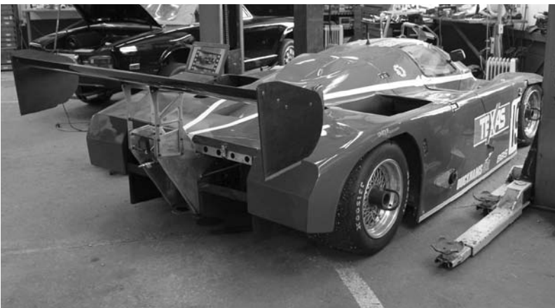
Left: An Argo IMSA Prototype racer is in for a race prep. you can see video of this car at Sebring on U tube. Search Argo Race Car.