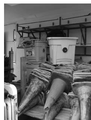
Where's Waldo? Before the clean-up, nothing was in it's place.