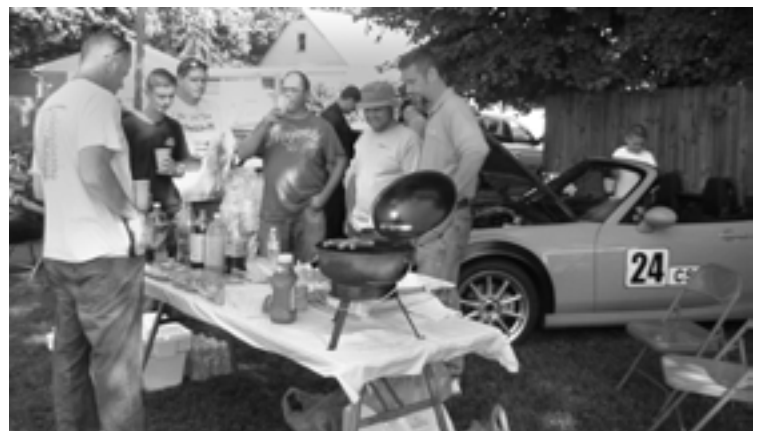
Eight members showed up with hotdogs, soft drinks and good humor to the delight of the Wilder Park folks.

KYR SCCA offers goodwill to the neighborhood near Papa John's Stadium. Several club members showed up at the Annual Wilder Park Chile Cook Off to show off their cars, share stories and serve hot dogs and soda to go along with the 7 different Chile recipes in the contest. Great music by the band kept things lively and the local fire department showed up to put out the hot dog grill, and stayed a while to eat dogs and sample chile.