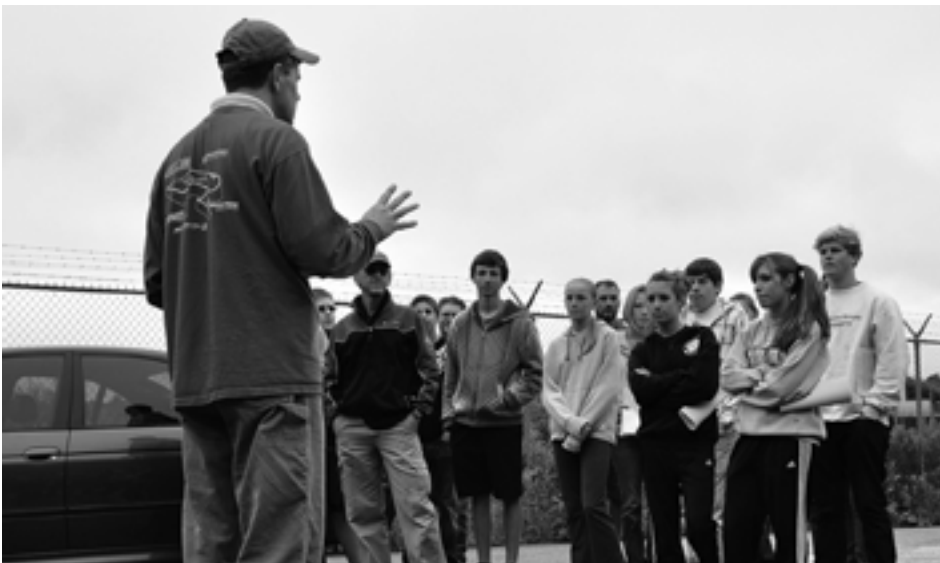
A street survival instructor explains the process of the next exercise to student drivers.

other locations, but where turned down because the schools were sold out. The driving exercises were the most memorable actions of the day for the students. Exercises are set up to best demonstrate tire limitations, brakes and weight transfer through a series of exercises such as slalom, 200’ skid pad, quick lane change, decreasing radius turn, panic stop using ABS and turning while braking. Instructors enjoyed the time with each student and the satisfaction seeing great progress in the student’s control of their car. The event went smooth and both students and their parents were appreciative of the effort from the Survival team.