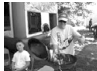
Downshift editor on fire.

Board Meetings are the last Wednesday of the month at Unique Automotive at 6:30 pm. .