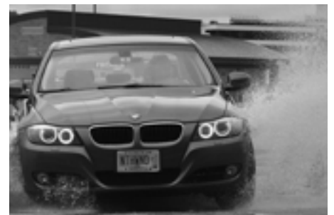
Keeping control of a car on a wet skid pad is one of the many challenges facing the students.