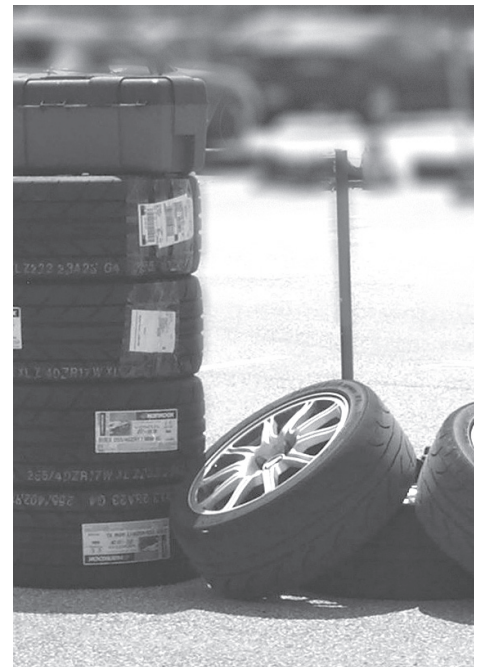
An autocrosser's (____)dream.