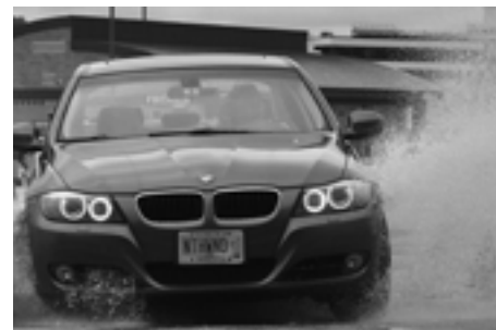
Keeping control of a car on a wet skid pad is one of the many challenges facing the students.