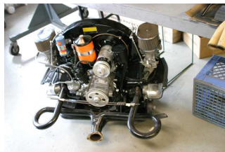
Restored Speedster engine

While the paintwork is completed and the engine & transaxle are restored & ready to be installed, the installation of electrical wiring, instrumentation, and the interior is yet to be completed before the vehicle can be "adopted" by its owner in Madison, Indiana.