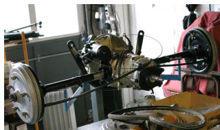
Restored transaxle ready to be installed.